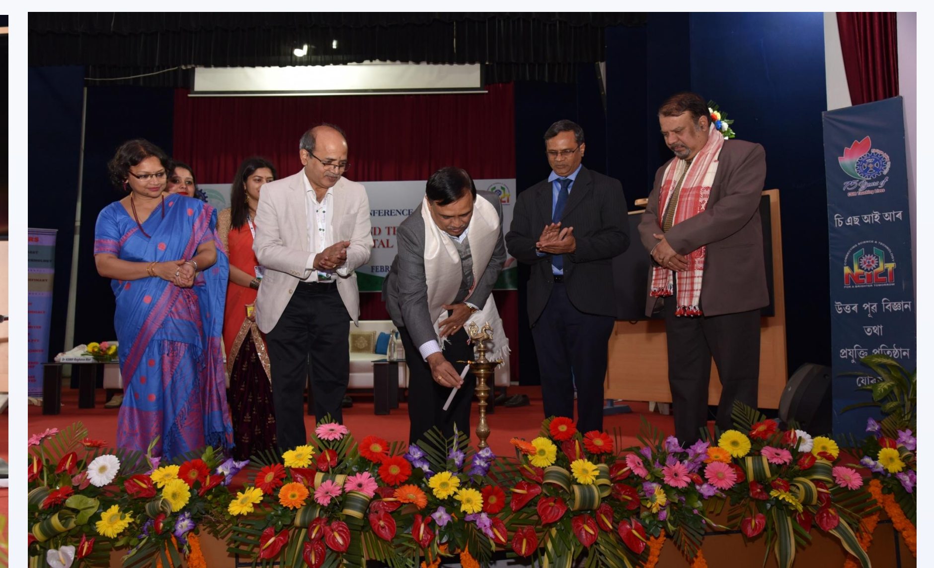
Lighting of lamp by chief guest & other dignitaries