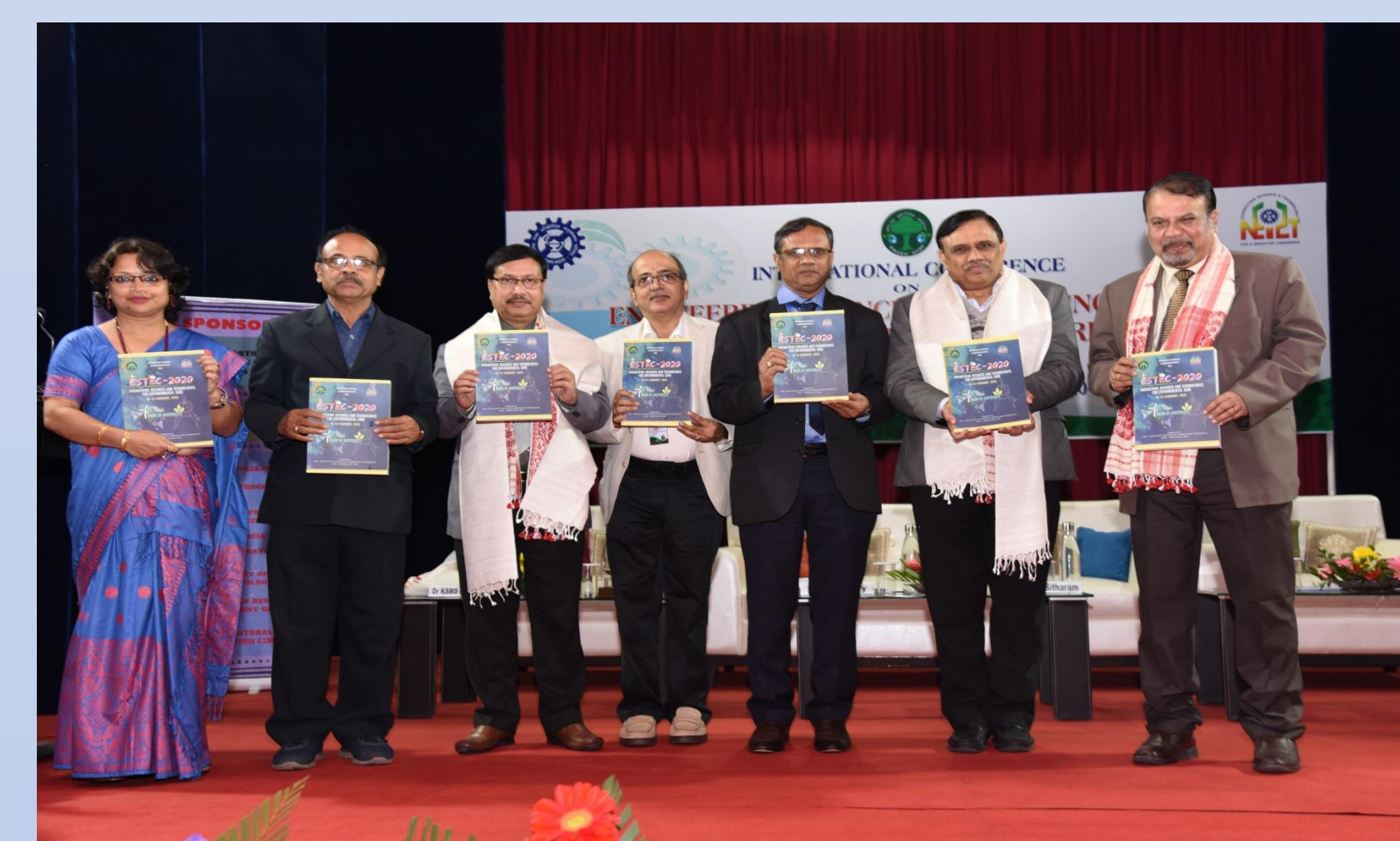
The ESTEC souvenir was released by all the dignitaries in presence of Director, CSIR-NEIST